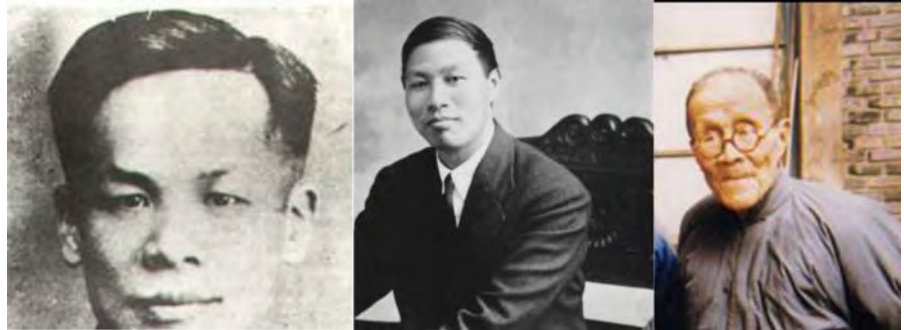
from left: John Sung; Watchman Nee; Wang Mingdao

I am an observer, but I am not a participant, and what I write and share today has to do with my observations over years of working in both the Chinese diaspora as well as my travels in China from the mid-1980s to the mid-1990s.