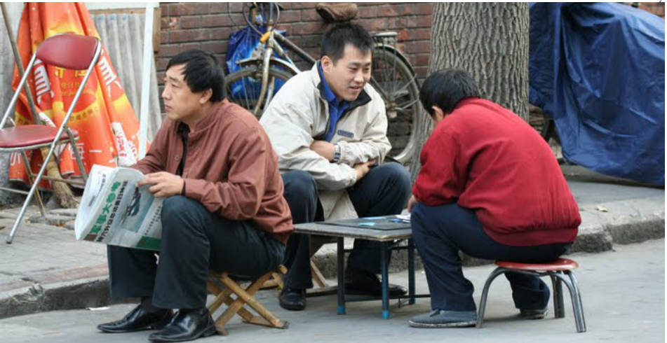
UNEMPLOYED PEOPLE actually "work" for mian zi . They leave home as usual in the morning as if they were going to work, but they do not end up at their previous workplaces but stay with friends or go to parks or cinemas to kill time.

Reports say that several hundred billion Chinese yuan are spent on banquets in China each year. Restaurants have become a performing stage for people eager to achieve their ends. They display intimate feelings, cope with bosses, negotiate prices and resolve conflicts. Obviously, food is not the real issue for either the host or the guest. Refusing to "perform" on this stage means that many things one may want to see happen will not be accomplished. Not understanding the significance of eating in Chinese culture means you